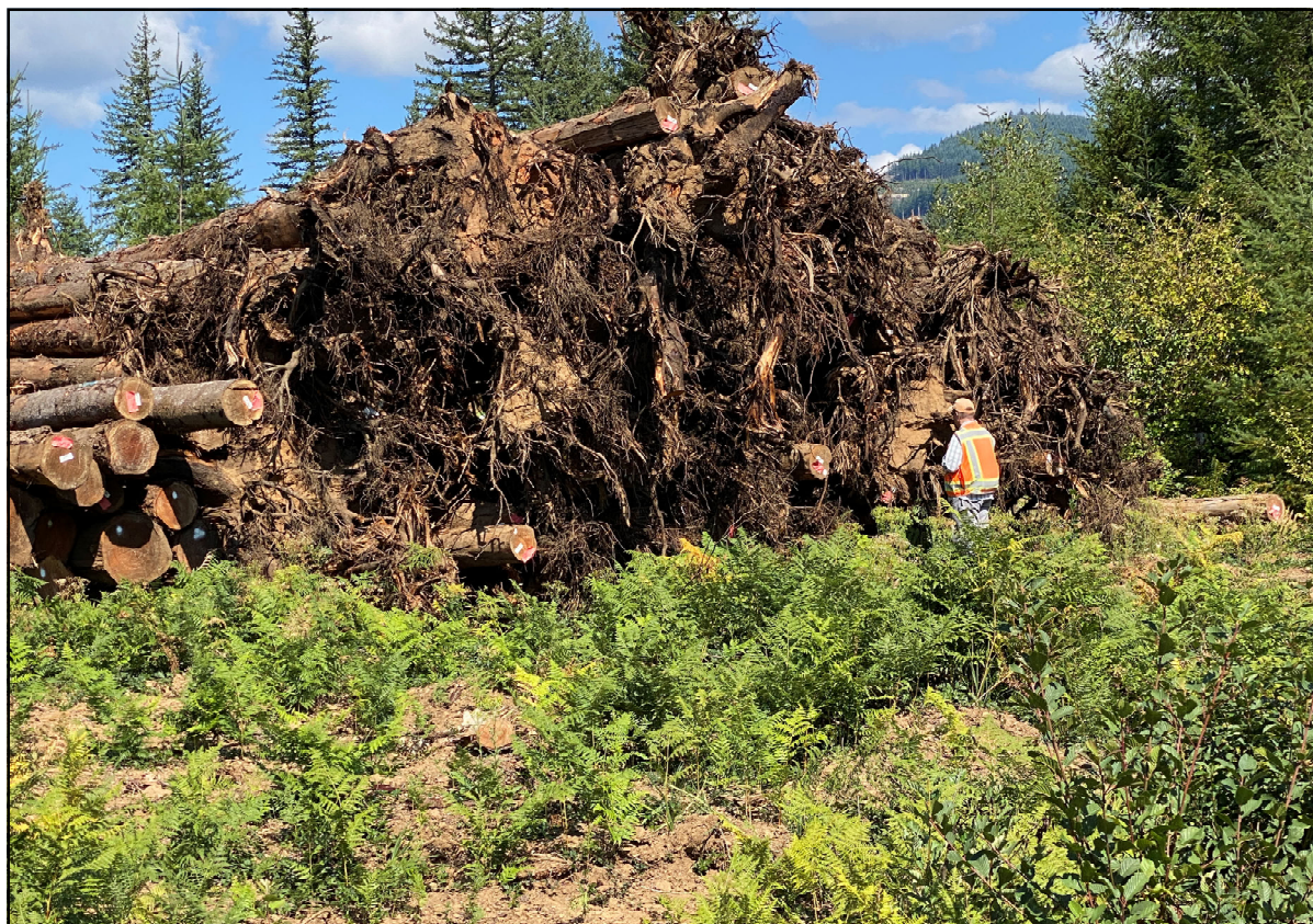
Photo of Log Deck with Tribe-Supplied Large Wood (Stick Logs and Rootwad Logs)