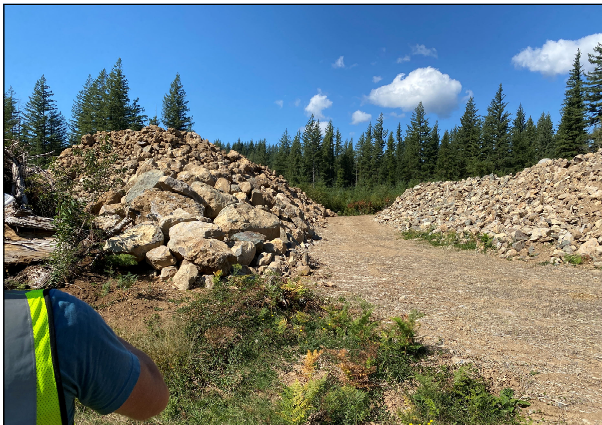
Photo of Screened Materials Available Onsite