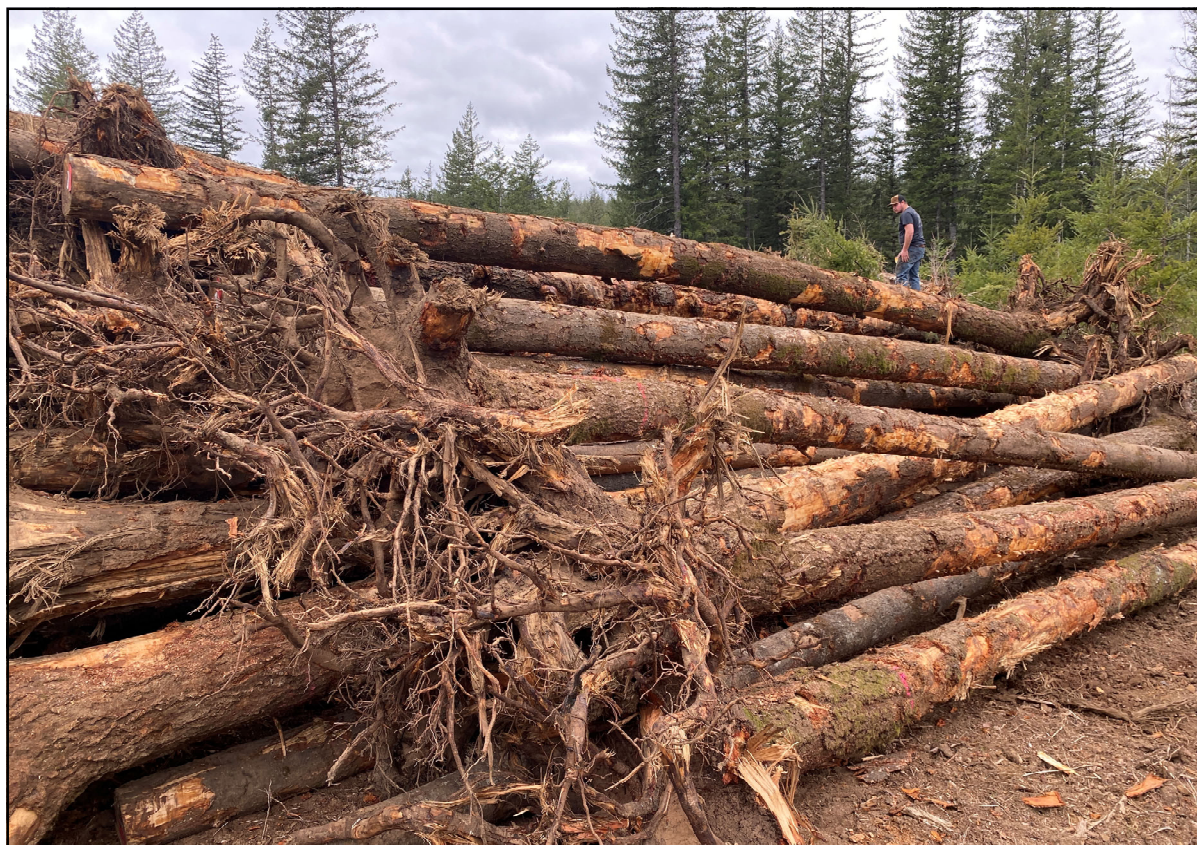
Photo of Log Deck with Tribe-Supplied Large Wood (Stick Logs and Rootwad Logs)