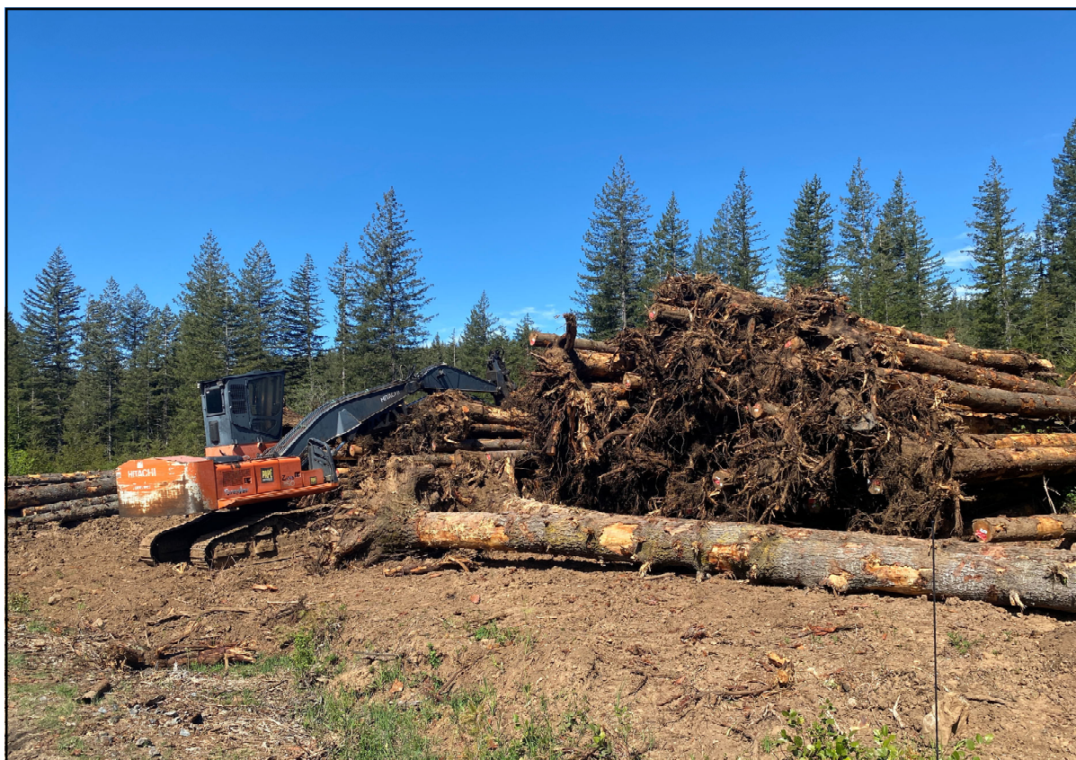
Photo of Log Deck with Tribe-supplied Large Wood (Stick Logs and Rootwad Logs)