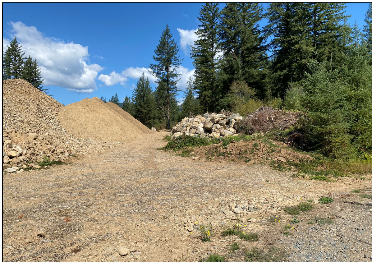
Photo of Screened Materials Available Onsite