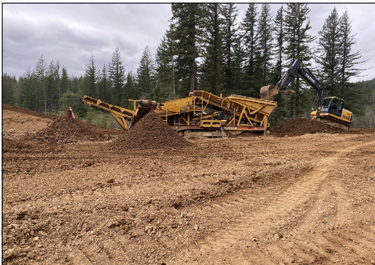
Photo of Screened Materials Available Onsite