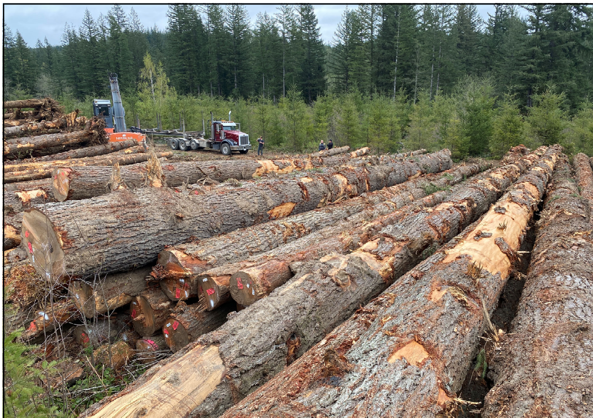
Photo of Log Deck with Tribe-supplied Large Wood (Stick Logs and Rootwad Logs)