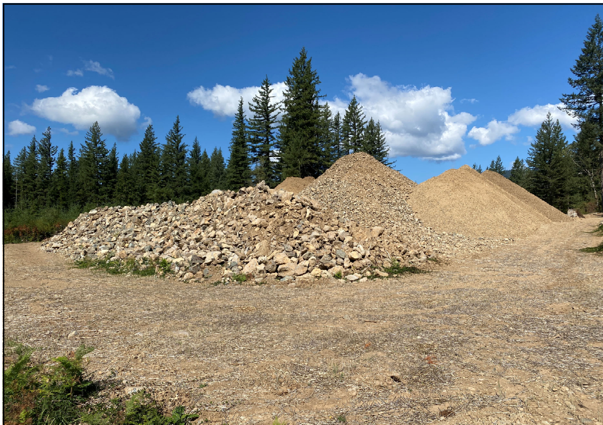
Photo of Screened Materials Available Onsite